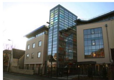
Brasenose Graduate Accommodation, Hollybush Row, Oxford, OX1 1JH

For those of you living in Hollybush Row , please note that you are responsible for tidying your rooms and kitchens that you share. Feel free to contact our BNC accommodation manager ( accommodation@bnc.ox.ac.uk ) to request cleaning cloths, rubbish/recycling bags, or if you run into any problems regarding this.