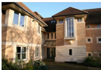
St. Cross Annexe, St. Cross Road, Oxford, OX1 3TU